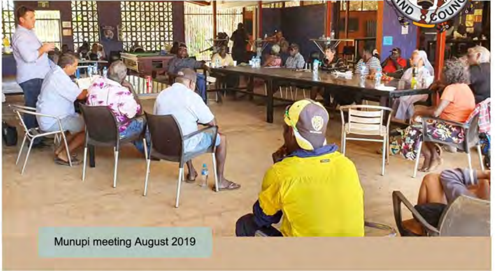
Munupi meeting August 2019