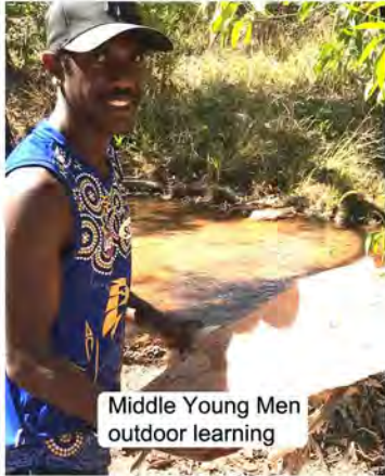
Middle Young Men outdoor learning