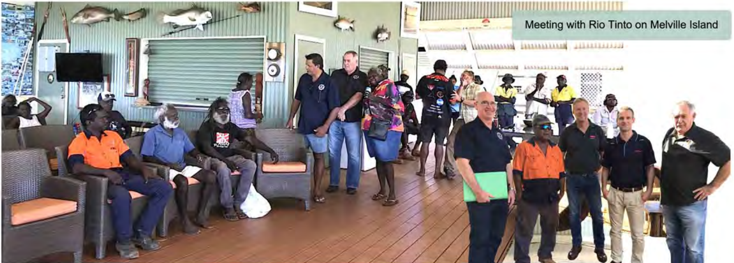
Meeting with Rio Tinto on Melville Island