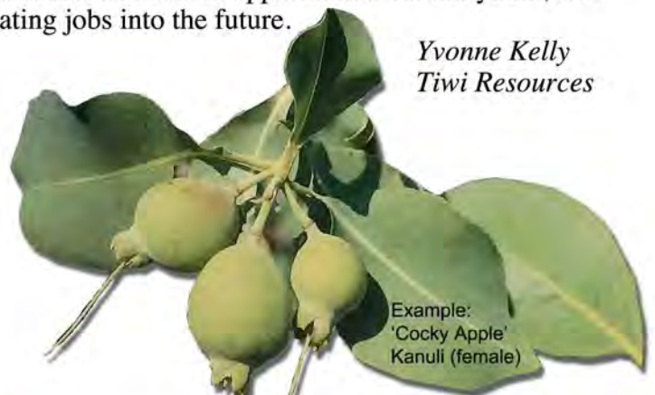
Example: 'Cocky Apple' Kanuli (female)