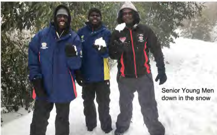
Senior Young Men down in the snow

This term has been one of many opportunities and achievements for our students at Tiwi College.