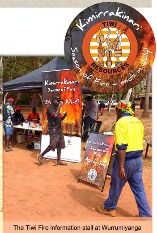
The Tiwi Fire information stall at Wurrumiyanga