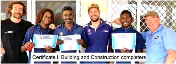
Certificate II Building and Construction completers