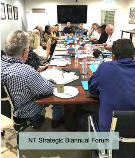
NT Strategic Biannual Forum