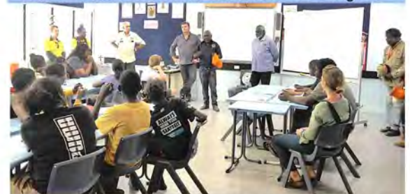
Xavier Catholic College students also learnt about pathways to future employment, including joining the Tiwi Ranger program or working for Tiwi Plantations Corporation.