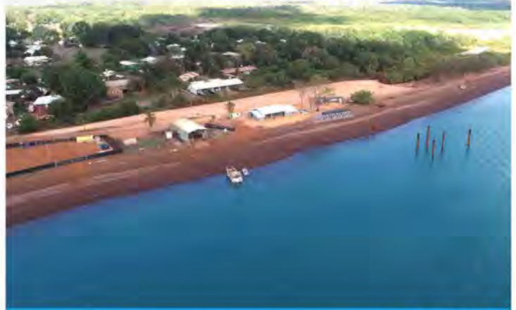
Works on pontoons and Visitor Centre in August and September