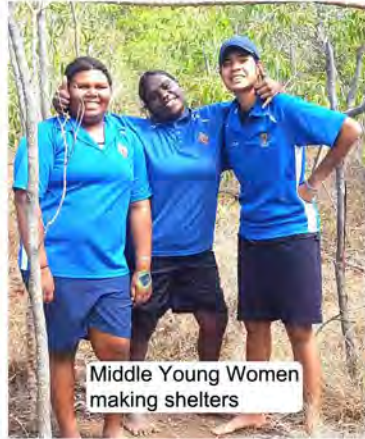
Middle Young Women making shelters