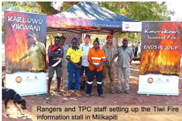
Rangers and TPC staff setting up the Tiwi Fire information stall in Milikapiti