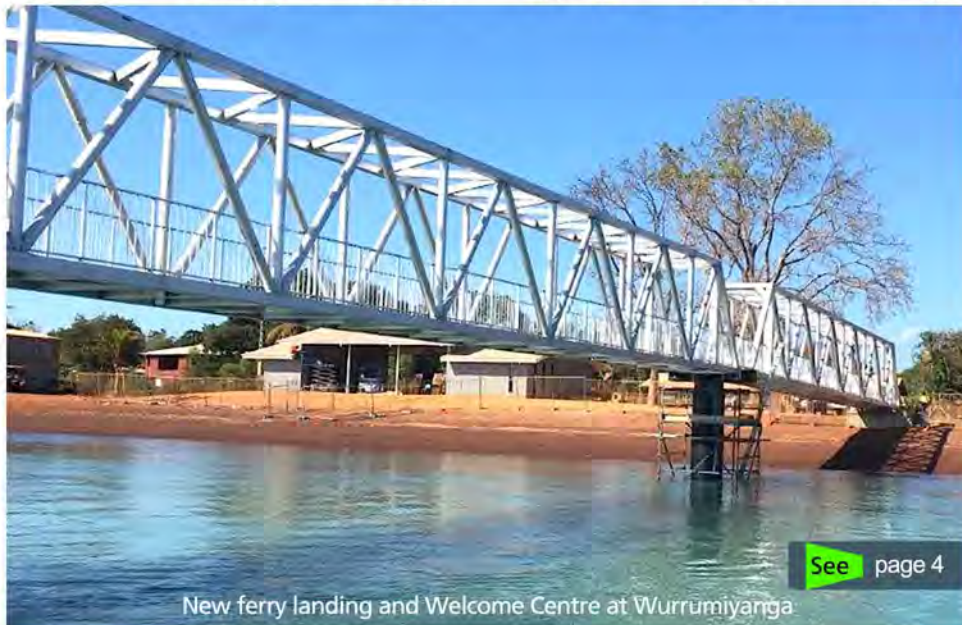
New ferry landing and Welcome Centre at Wurrumiyanga