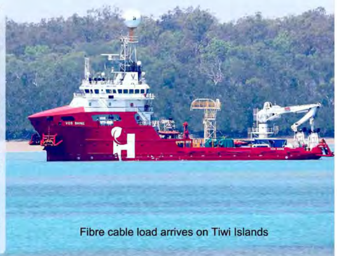
Fibre cable load arrives on Tiwi Islands