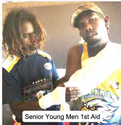
Senior Young Men 1st Aid