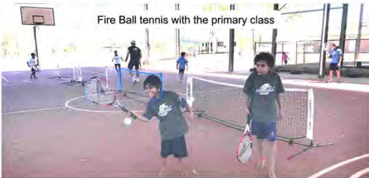
Fire Ball tennis with the primary class