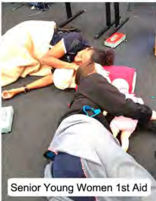
Senior Young Women 1st Aid